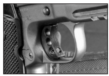
The adjustable trigger is D&L Sports' aluminum 3-hole unit with a serrated face.

Controls consist of a single-sided, reasonably extended serrated thumb safety, a heavy duty, heat-treated, fitted, serrated slide stop, and a checkered tactical magazine release,