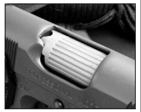
Ball-milled flutes function as sand cuts to work grit and sediment out from between the barrel and slide. A barrel hood port allows for a visual chamber inspection.