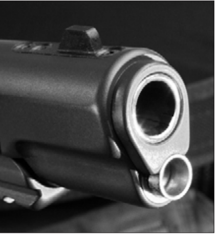
A D&L match barrel and bushing set are fitted for accuracy and functioning, and a bushing flange is used for durability.

The frame continues with the trend of melted or dehorned edges, an undercut triggerguard and reinforced dustcover frame rail, which is integrally machined to accept light and laser accessories. 30 line-per-inch (lpi) checkering is cut into the frontstrap, as well as the arched mainspring housing, which is nicely blended at the bottom to function as part of a magazine well that is melted into a bevel from all four sides. A low-profile funnel is also machined as part of the frame, rather than being pinned or welded. A high swept beavertail grip safety with speed bump is tightly fitted and blended to the backstrap. Dave bolts on his plunger tube, rather than simply staking it on like most makers. This makes the attachment of the tube more solid and reliable