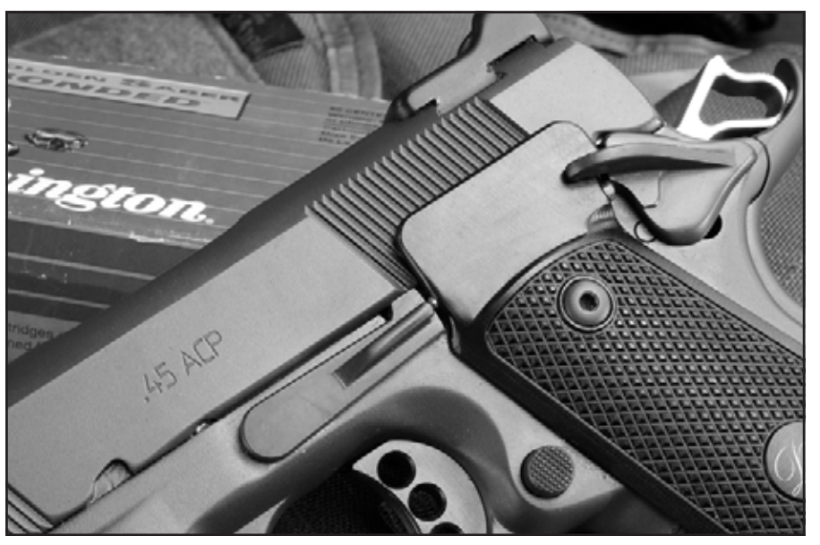
The controls—a single-sided, reasonably extended serrated thumb safety, heavy-duty, heat treated, fitted, serrated slide stop, and an extended checkered tactical mag release—are easily manipulated.

Getting back to the slide, angled cocking serrations are cut in the standard rear location, as well as just forward of the opened, flared, and radiused ejection port. A traditional "internal" extractor is used, which is tuned, as well as the ejector. Dave uses a cut on the extractor claw that he refers to as a "tanto" cut, which he believes makes the extractor more durable under hard use. Sights are heavy-duty low-profile high-visibility units with three-dot tritium inserts. The rear sight is dovetailed into the slide, and set with dual hex screws—the sight has a significant shelf